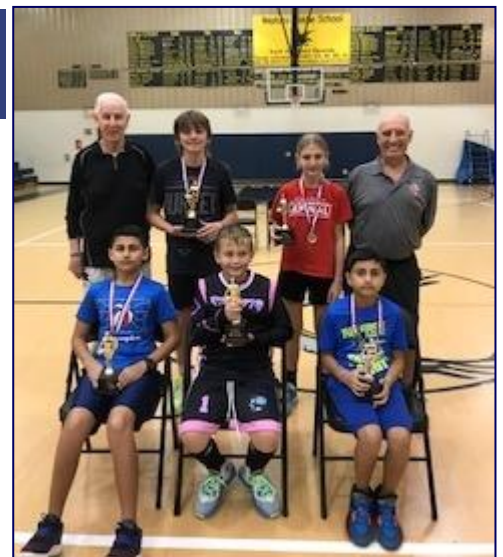
Congratulations District Winners! Good Luck at the State Championship!

2023 HOOP SHOOT April 20-23, 2023 NATIONAL FINALS https://www.elks.org/hoopshoot/nationalFinals.cfm